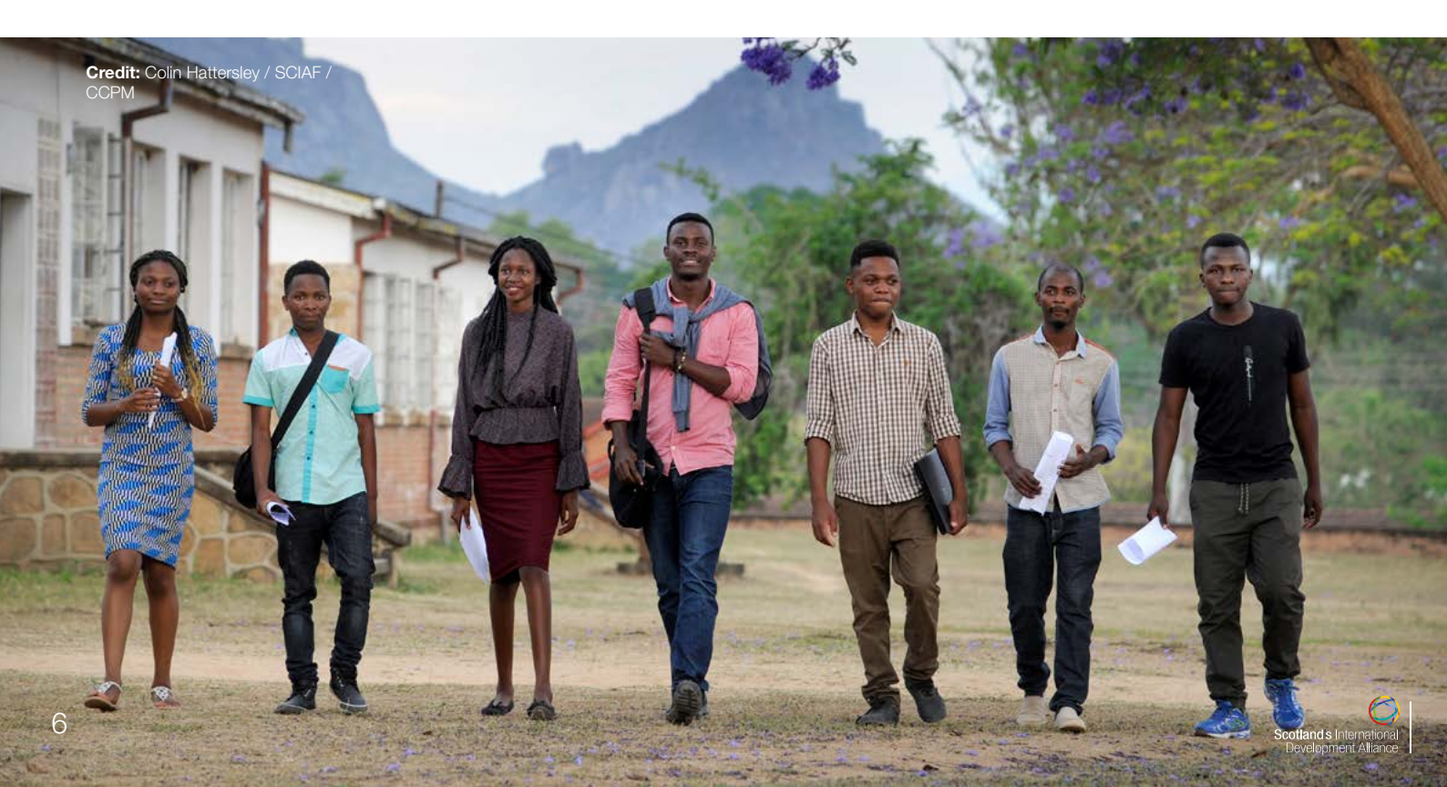
Photo Below: Student climate activists from the Catholic University of Malawi in Blantyre who work with the Climate Challenge Programme Malawi (CCPM) to promote climate justice. The CCPM is a Scottish Government programme, administered by SCIAF, that supports communities in southern Malawi find sustainable solutions to the climate crisis they face, and improve climate literacy.

4. http://www.intdevalliance.scot/how-we-help/policy-and-advocacy/policy-coherence-sustainable-development