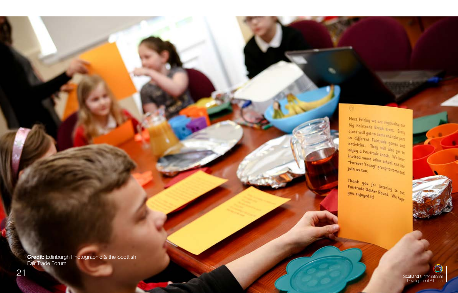
Photo below: Pupils at Stenhouse Primary School (Edinburgh) taking part in a Fairtrade breakfast as part of their learning about Fairtrade.