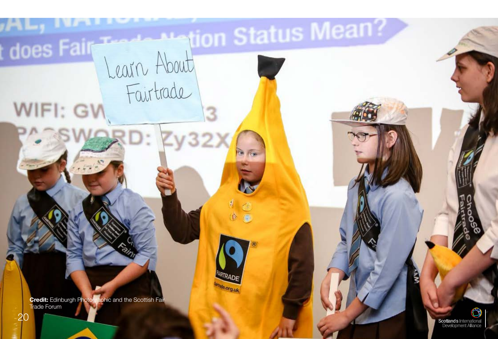
Photo below: Pupils from the Fair Trade Group at St Elizabeth's Primary School in Hamilton promoting learning about Fair Trade at a local event.

Scotland's Development Education Centres(DECs) have been providing high quality professional learning for teachers and schools in GCE for many years. Since 2014, this has been funded annually by the Scottish Government and it is critical this continues.