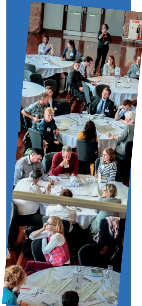
PHOTO: ANNUAL CONFERENCE 2016