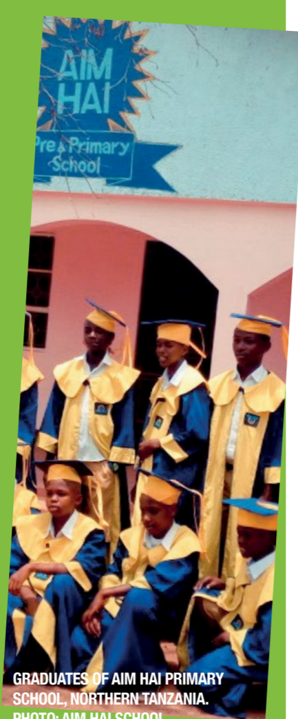
GRADUATES OF AIM HAI PRIMARY SCHOOL, NORTHERN TANZANIA.